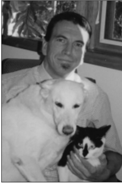
Recently, a client brought in her young mixed breed dog "Rex" with a recent history of one week of vomiting and not

keeping food down. Accompanying the woman and dog was her three year old daughter cradling in her arms a very worn looking, but obviously much loved plastic doll. The doll had shocks of hair missing, the painted features on the doll's face were worn off, and the doll had only one arm.